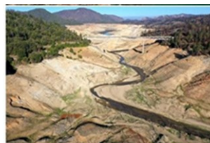
Lake Ororville California reservoir – Left: April 2018; Middle: April 2021; Right: July 2021

The past three months of disaster-filled weather in the USA ranks as the hottest summer on record.