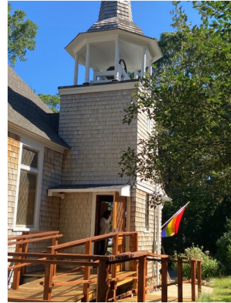
Ringin' of the bell